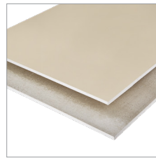
Glasroc H TileBacker