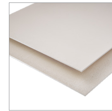
Glasroc F MultiBoard