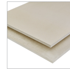
Glasroc F FireCase