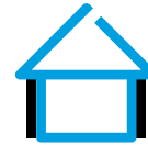
External wall insulation