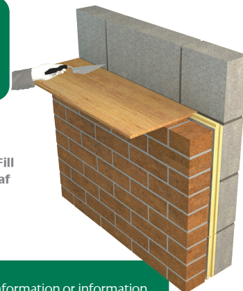
Figure 2 - Use of Eco-Cavity Full Fill when installing the inner wall leaf

To access pre-existing product information or information relating to previously sold/discontinued products please email marketing@ecotherm.co.uk .